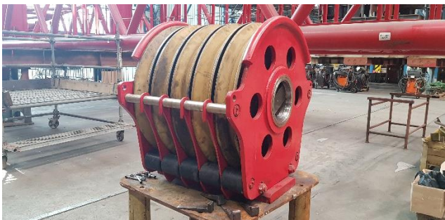
Roller bearing before installation of offshore seals